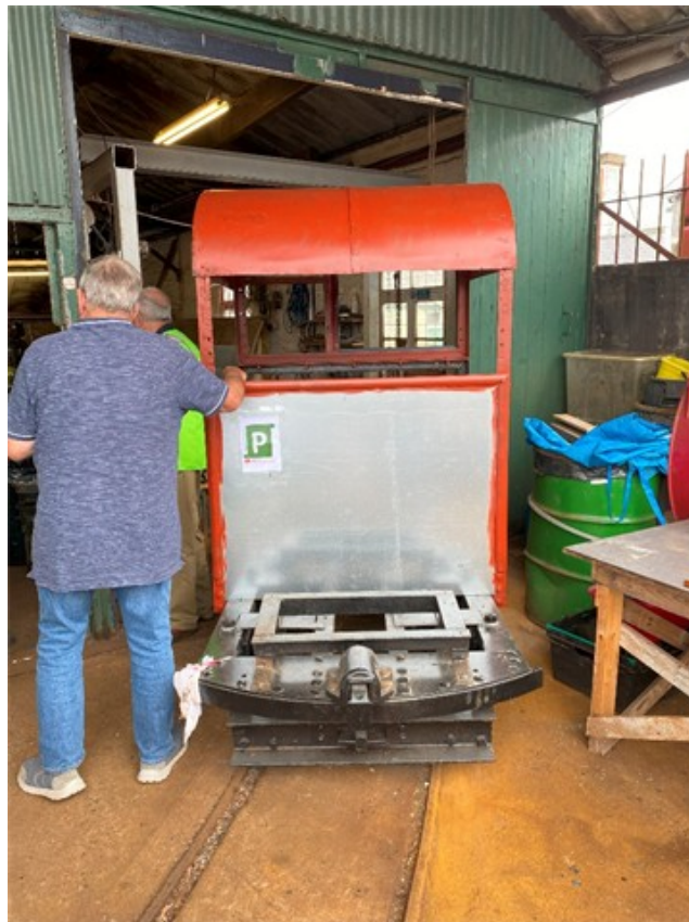
Tractor 2, partially rebuilt, on display at Heritage Day

Being a driving carriage, there are other elements to the train carriage, including new cabling for the electrical systems. Following dismantling and inspection of carriage the engineering team are confident that the breaking system and gearing is in good order.