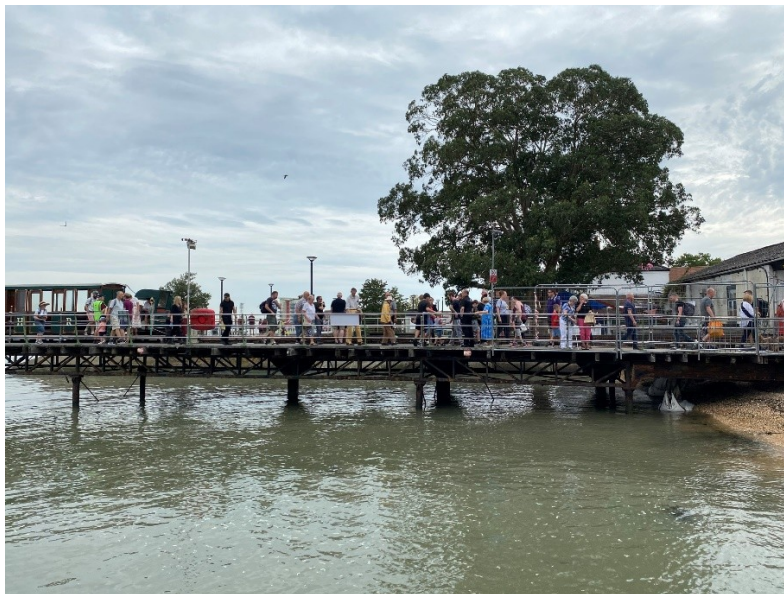
Visitors walking the Pier on Heritage Day 2023

Hythe Pier Heritage Association is a Charitable Community Benefit Society The Grove, 25 St Johns Street, Hythe SO45 6BZ Email: info@hythepierha.org.uk