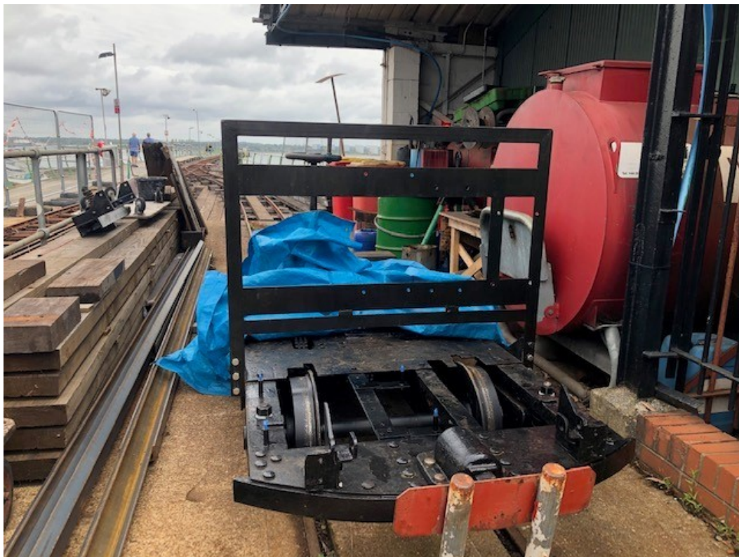
TRACTOR 2 Chassis, wheels and the braking unit complete July 2023

Being a driving carriage, there are other elements to the train carriage, apart from new cabling for electrics, there is confidence among the engineers that the breaking system and gearing is in good order which is fantastic to hear.