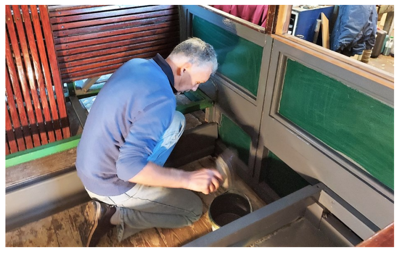
Priming of interior woodwork continues

Our Community Working Together to bring our Heritage and History to life info@hythepierha.org.uk Hythe Pier Heritage Association is a Charitable Community Benefits Society (Reg No 7708) The Grove, 25 St Johns Street, Hythe SO45 6BZ