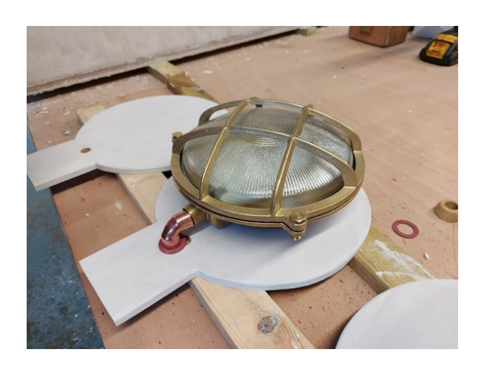
Above left: Backing boards for lighting units and Above right: Lighting unit loose assembled at the Shed (at the Pier)